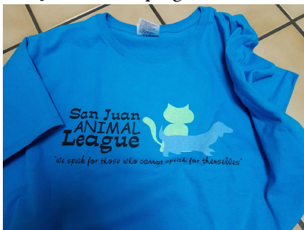
Screenprinting by Kopy-Rite Printing & Graphics